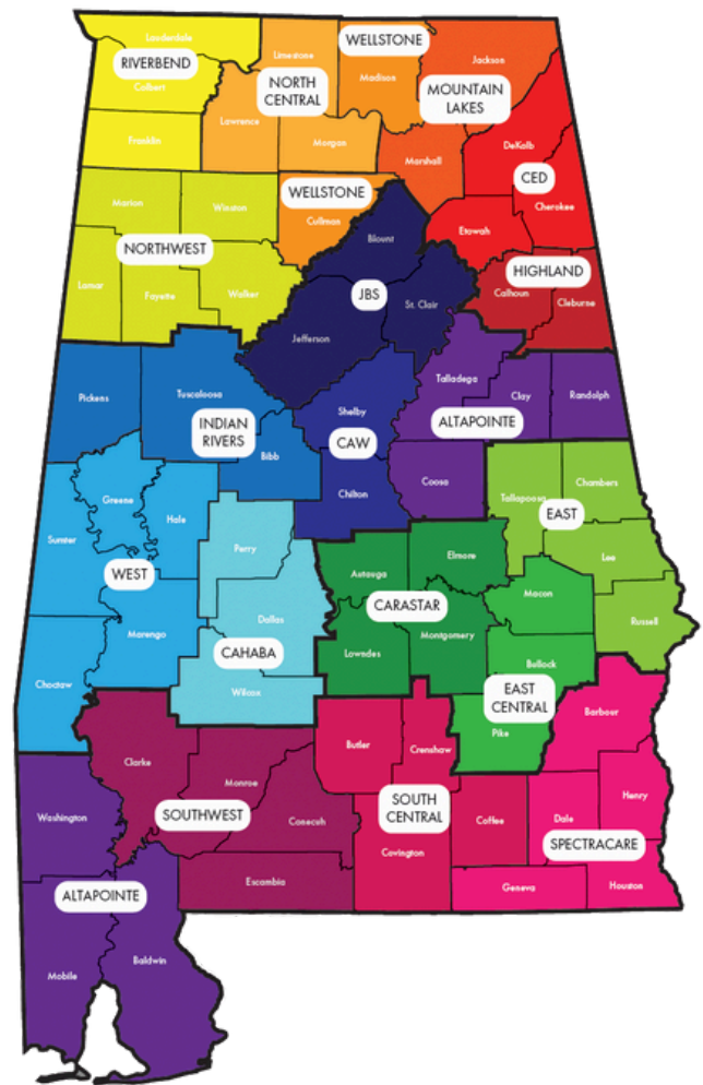
Community Mental Health Center Map

The Mental Health Centers listed are available for 24/7 assistance, sorted by county. Contact the provider closest to you to receive mental health services.